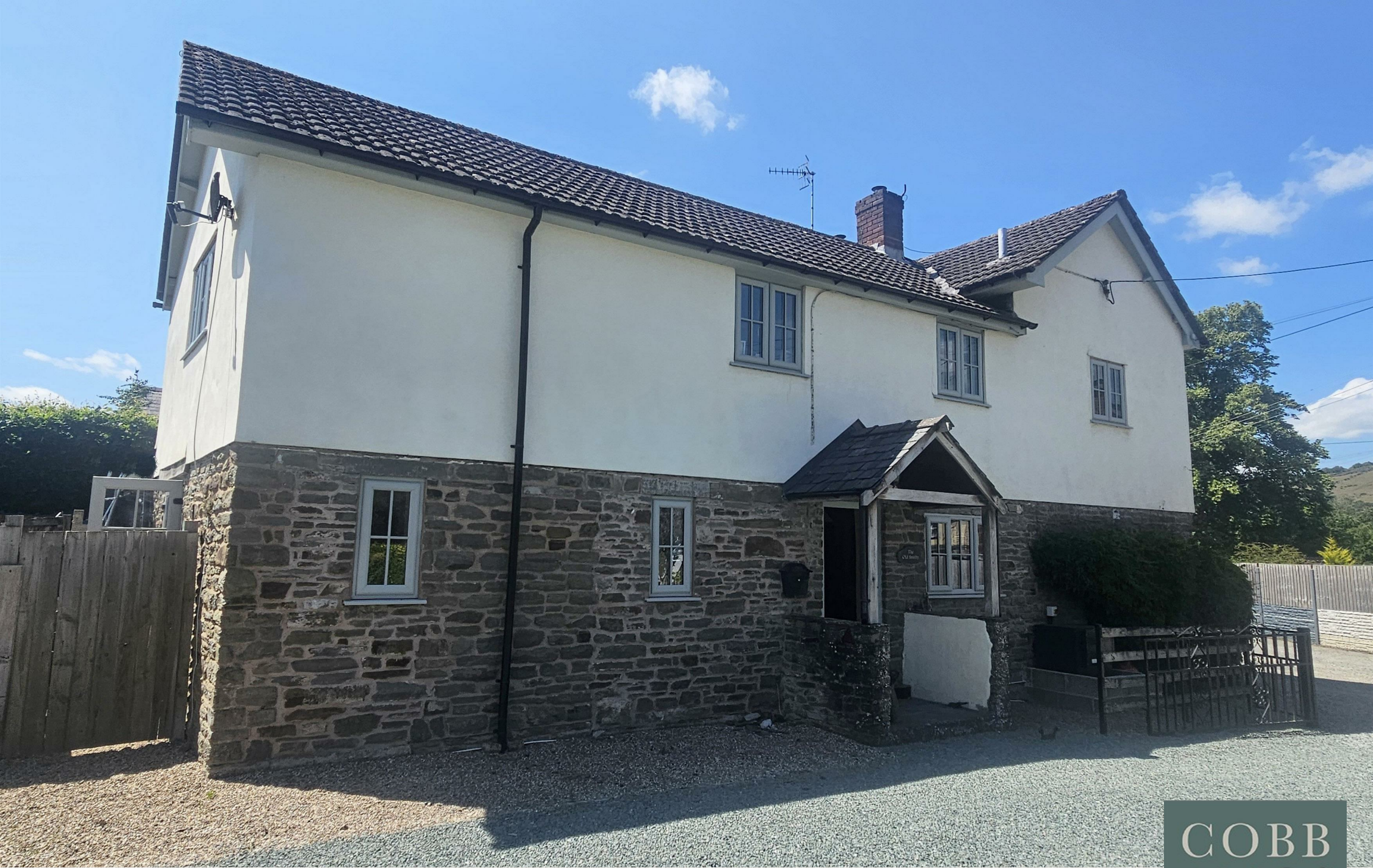
Ye Old Smithy, Bucknell, Shropshire, SY7 0AA Guide Price £390,000